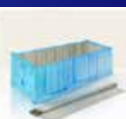
OPEN TOP CONTAINERS