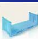
FLAT RACK CONTAINERS