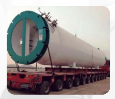
DELIVERY @ QATAR POWER PLANT