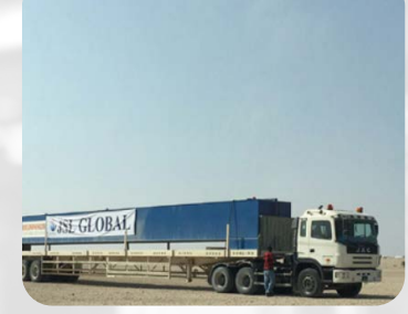
26-METER-LONG GIRDER EXPORT TO GERMANY

Your project logistics partner for Qatar & Oman